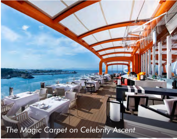
The Magic Carpet on Celebrity Ascent