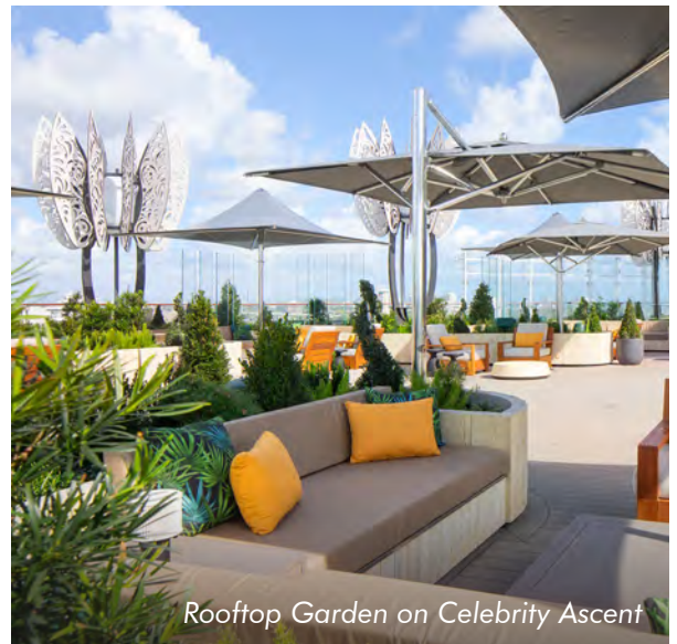
Rooftop Garden on Celebrity Ascent

Naples is a rich historical city located on Italy's stunning Amalfi Coast. A tour around Naples' grand piazzas, cathedrals, and castles in the old center will take you back centuries. The flavors of Italy are bursting here, with plenty of opportunities to sample olive oil, mozzarella, pizza, and wine. This Italian city is lovely to explore on its own, but it also offers easy access to beautiful destinations such as Pompeii, Capri, and the entire Amalfi Coast. Consider an excursion to explore the Pompeii excavations or the ruins of Herculaneum, offering a more intimate glimpse into the past. The nearby town of Sorrento, perched on dramatic cliffs overlooking the sea, is another must-visit destination. Here, you can learn about the intricate art of intarsia, stroll through charming streets, and sip on refreshing limoncello made from the region's fragrant lemons.