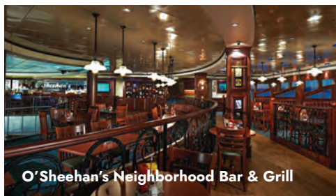
O'Sheehan's Neighborhood Bar & Grill

Try a few of the many beers on tap, catch a game on the two-story TV screen or play some billiards or darts. Seating capacity 196.