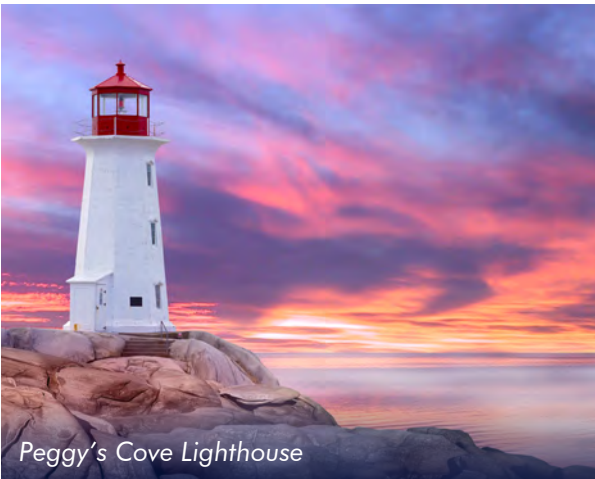
Peggy's Cove Lighthouse