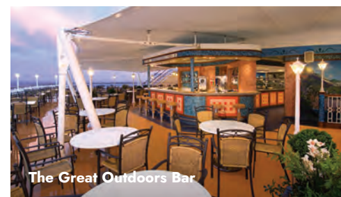
The Great Outdoors Bar

Sip on a refreshing beer at this bustling open-air buffet.