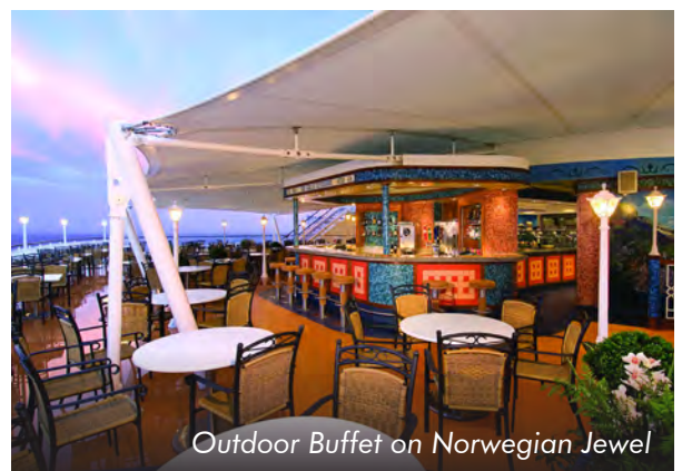
Outdoor Buffet on Norwegian Jewel