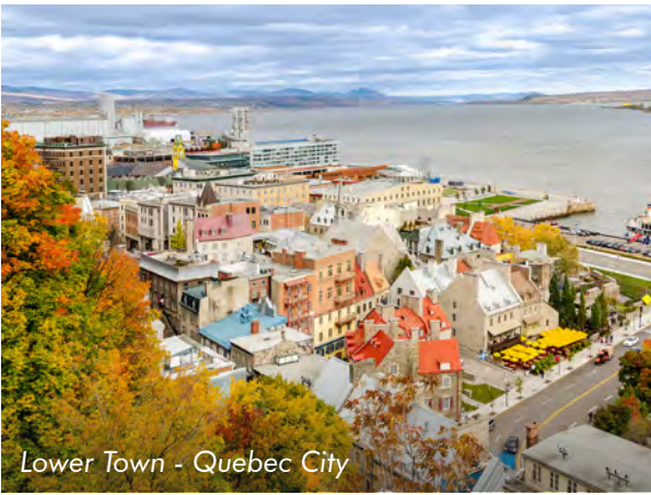
Lower Town - Quebec City